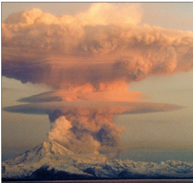
Volcanoes also inject aerosols into the stratosphere – and eruptions have been followed by terrible droughts and famine