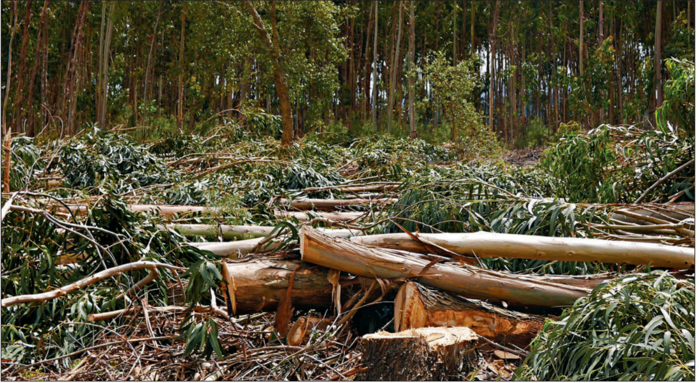
Biodiversity-destroying eucalyptus plantations would undoubtedly provide much of the raw material for BECCS

Despite all the emphasis on BECCS from industry and policy-makers, it is clear that the technology is not keeping up with expectations.