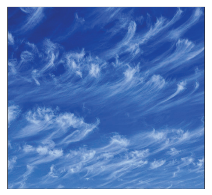
Cirrus clouds

A significant concern is that CCT could be operated at a local scale with the intention to create climate responses in certain areas. This kind of localised deployment could cause negative impacts on nontarget neighbouring regions and communities potentially precipitating serious conflicts. Climate events likely won't be contained: one country avoiding a heatwave could cause flooding in another.