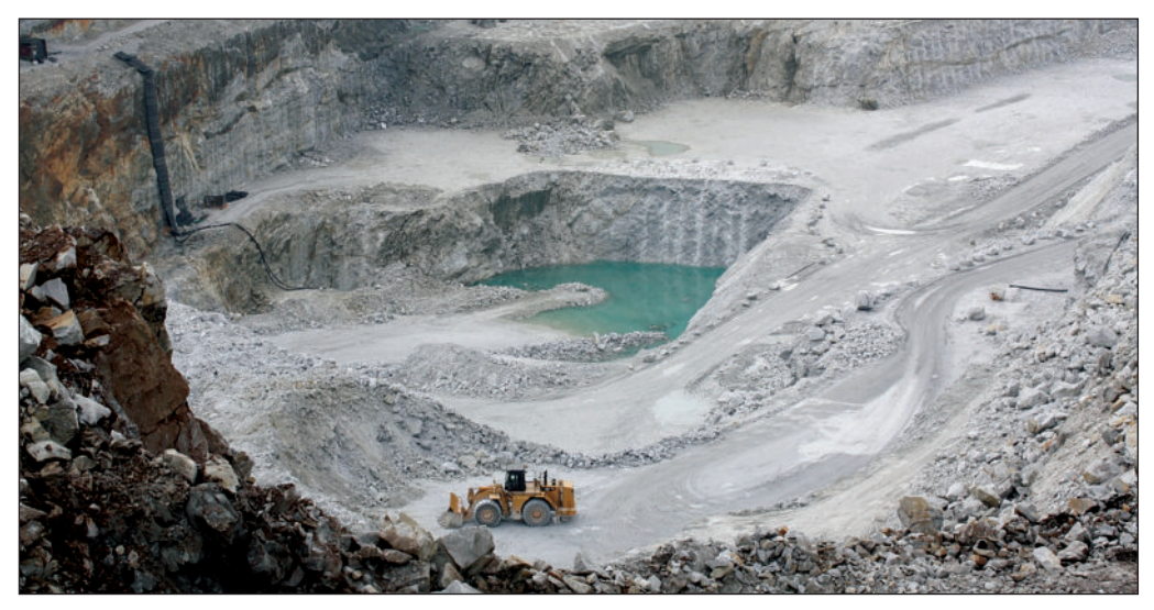
A limestone quarry

Furthermore, EW requires these big quantities of rocks to be milled, transported and dispersed, which further increases the CO_2 and environmental footprint of EW.<sup>8</sup>