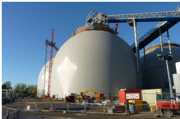
Drax's wood pellet silos.