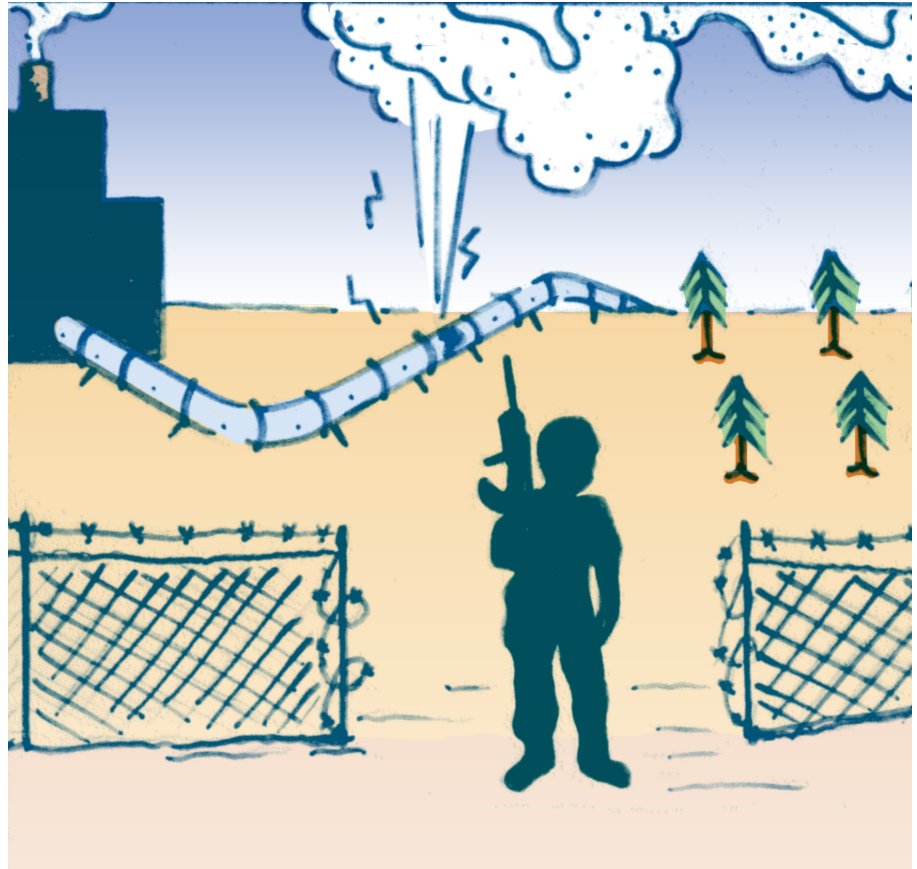
Scaling up CCS would require massive global infrastructure, and a significant portion of the “stored” CO 2 would be likely to escape via leaks.

The symbiotic relationship between CCS and EOR undercuts its (theoretical) potential as a serious climate-change response. In North America, carbon captured from the only large-scale CCS-equipped