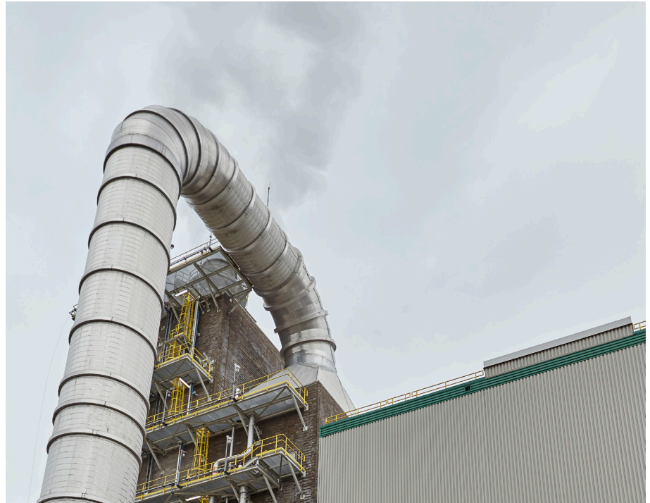
SaskPower, a failed attempt to greenwash emissions from coal.