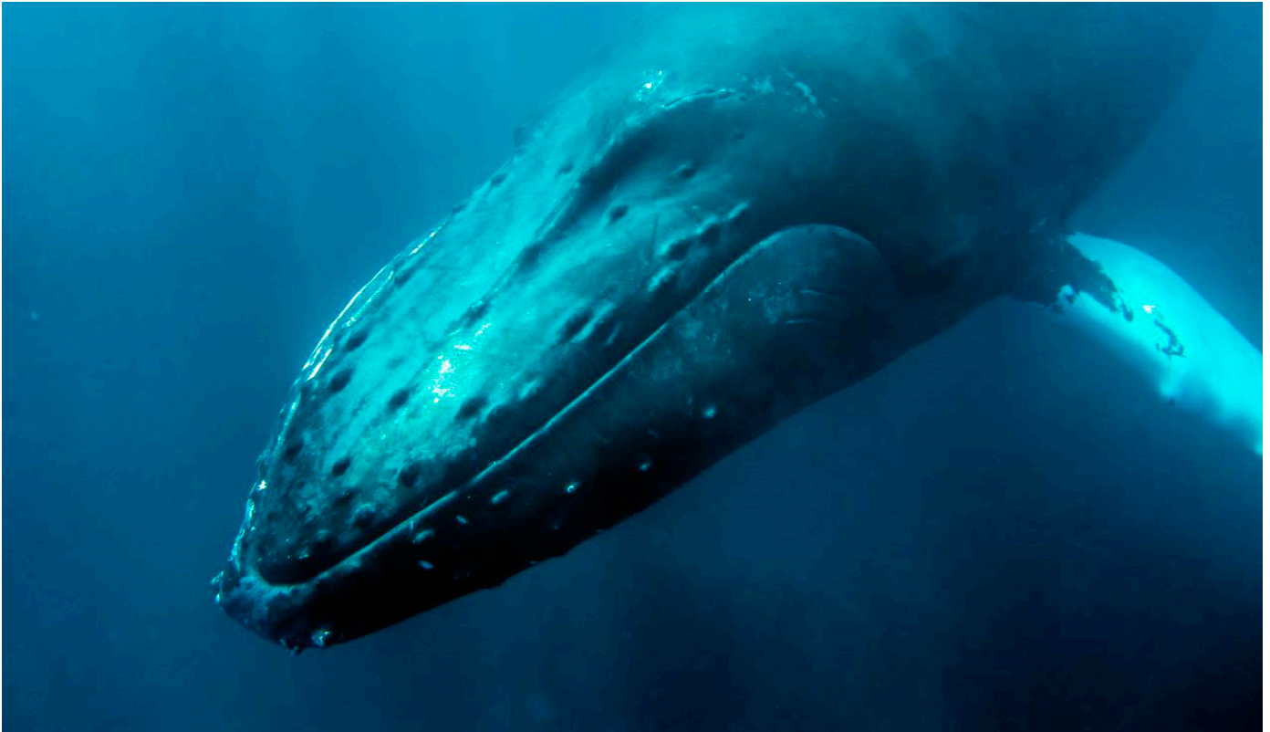
Whales and other marine life already do a very good job of mixing surface waters